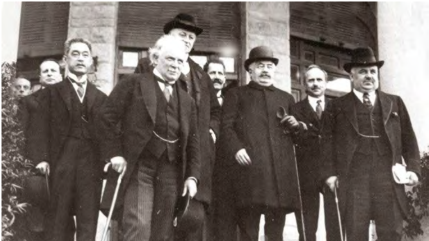
San Remo Conference, 1920

The delegates at the San Remo Conference had to discuss, among other matters, another, related, promise. This was the promise made to the Jewish people by the British War Cabinet in 1917 regarding the establishment of a Jewish national home in Palestine, a promise later known as the Balfour Declaration.