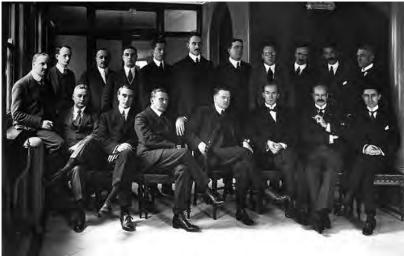
Bunsen Committee, 1915

The Committee recognized that the destiny of Palestine ‘must be the subject of special negotiations.’ Discussions then began in earnest with the French, in order to determine more specifically, the areas of interest for the British and the French.