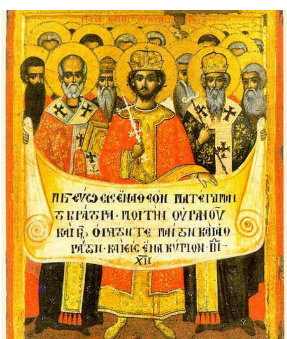
Council in Nicaea

The neo-Platonic philosophies during the early Church were rife and resulted in heterodoxies such as Gnosticism, Arianism, Nestorianism, Docetism and Manichaeism. To deal with these matters, the yet-to-be-baptised Constantine assembled the first ecumenical Council in Nicaea in Bithynia in AD 325 to bring together Eastern and Western Church factions.